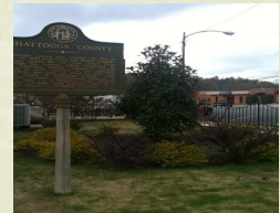
Landscaping at Courthouse by Chattooga Garden Club

Chattooga Garden Club has been active in Chattooga County for over 40 years. The club has sponsored many beautification projects throughout the county over the years. One of the most recent beautification projects was the new landscaping at the Chattooga County Courthouse which commemorated the building's 100th anniversary.